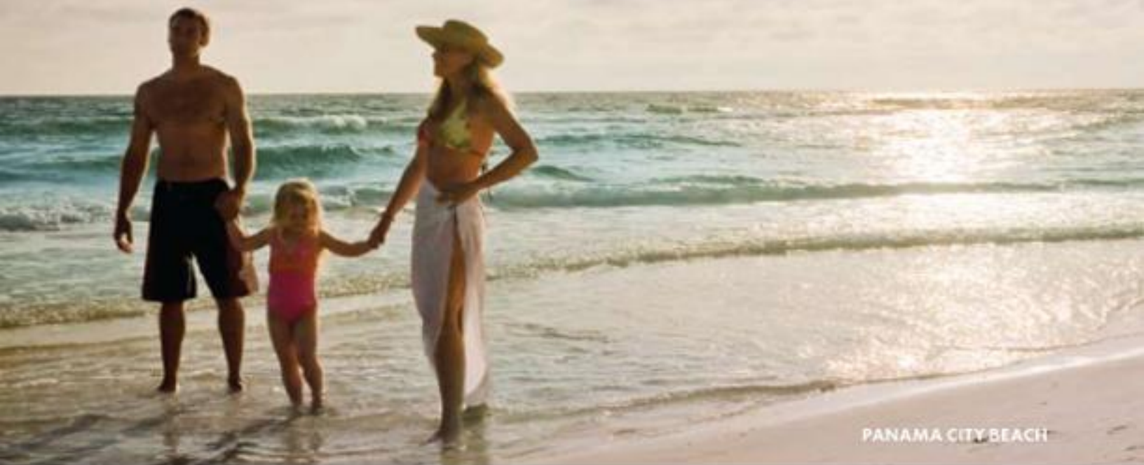
PANAMA CITY BEACH