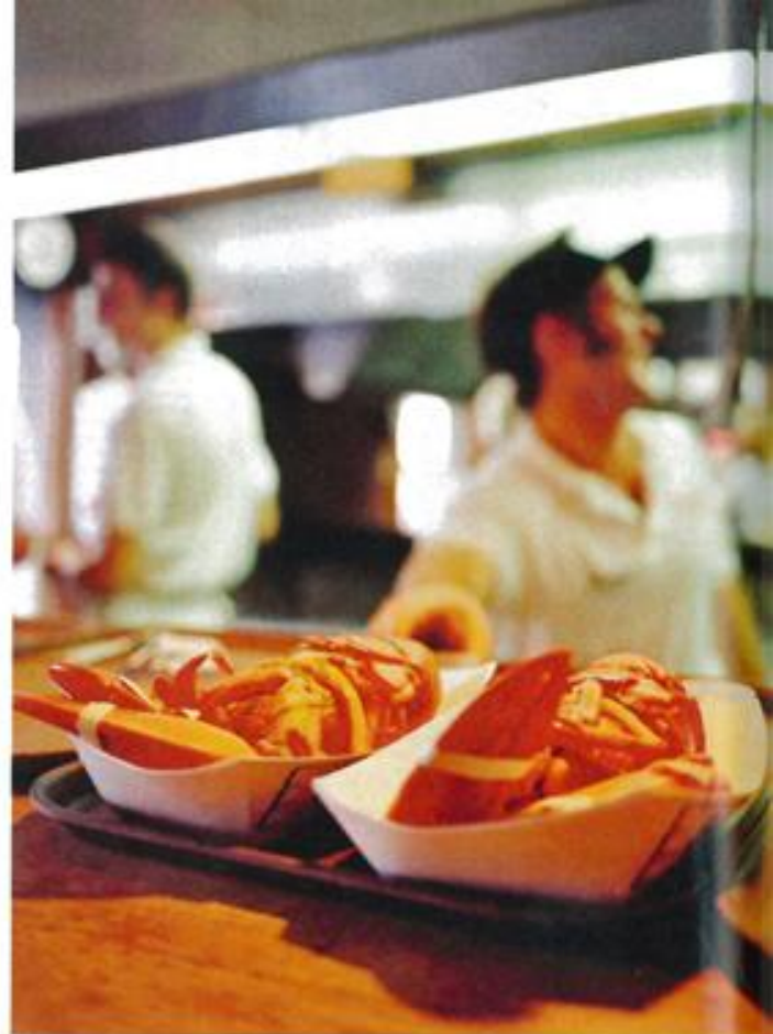
SURF-TO-TABLE DINING Clockwise from above left: The Shrimp Shack's dining pavilion; fresh lobster from Barnacle Billy's Restaurant, in Ogunquit, Maine; the Shrimp Shack's Apalachicola oysters three ways; nautical gear at Barnacle Billy's.